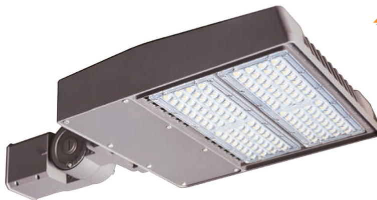
STRADA 120 cod. LST3120-NW (16335 lm) Temp. Col. 4000K Natural white