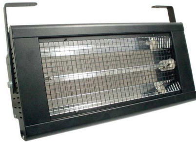
Strobe DMX 1500 Cod. EF6068